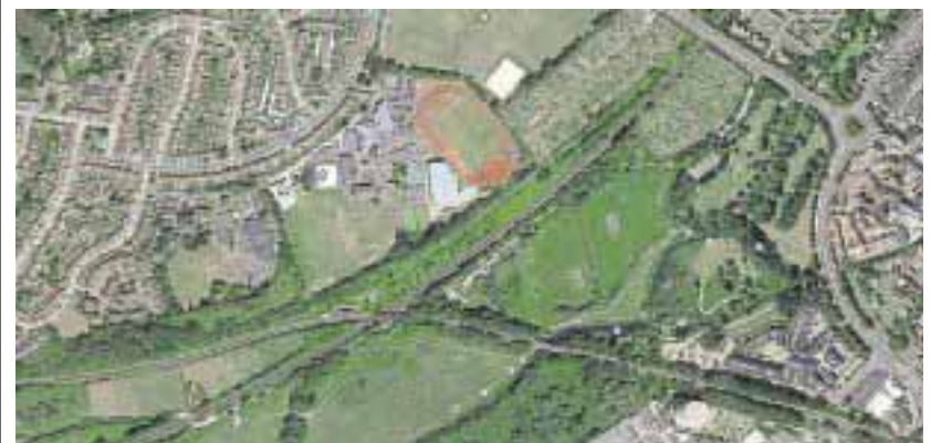
Map showing the location of the Canterbury Loop, between Canterbury Academy and Wincheap

The Canterbury Loop line remained usable until March 4, 1956, although some track lifting had started in October 1955. The double track embankment continues to remain intact, enabling practical reinstatement.