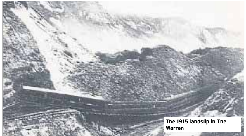
The 1915 landslip in The Warren