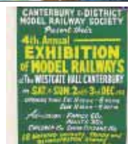
Exhibition poster from 1978