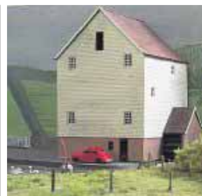
The Wickhambreaux Road layout and a typical Stour Valley water mill