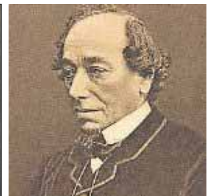
It was the era of great parliamentary battles between Gladstone and Disraeli

Live and local from our Kent studios every afternoon