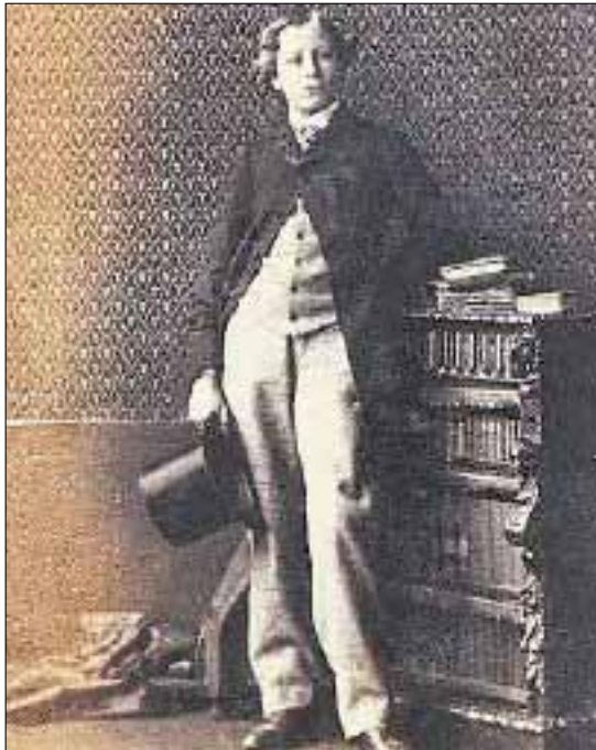
The election of Alfred Gathorne-Hardy, third son of the Earl of Cranbrook, in Canterbury was declared void

The 1880 general election gained notoriety for Canterbury when the result was declared void due to corrupt practices. The city was left with both parliamentary borough seats unfilled following a successful petition having been made to the electoral court.